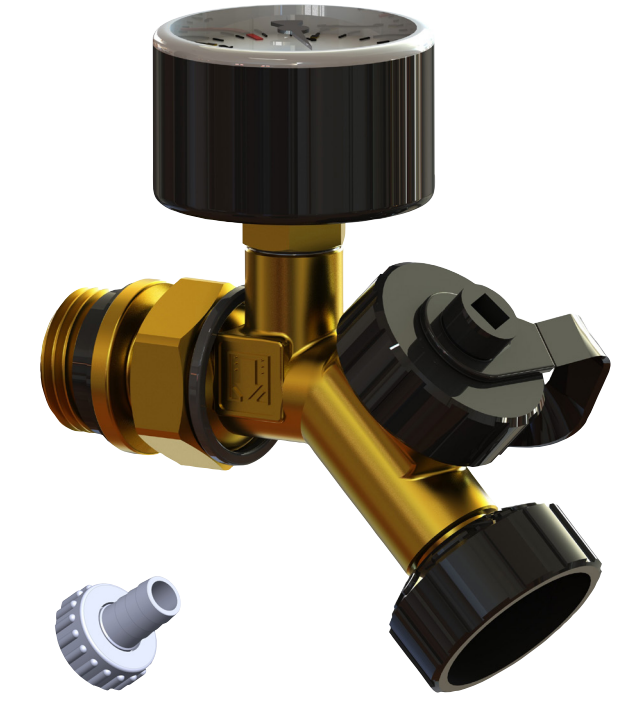
plastic hose nozzle with swivel

The WIVAK 2000 is a Filling Valve for heating systems. The valve has a \frac{1}{2} " male connector with seal-ring, a connection set for the waterhose, a spindle shut-off and a Pressure Gauge 0 - 4 bar.